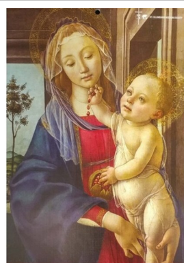
2021 Columban Art Calendar

If a parishioner is in need of anointing, reconciliation or pastoral care, please contact the parish office on 0416 923 484.